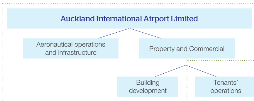
Figure 1: Auckland Airport's business activities